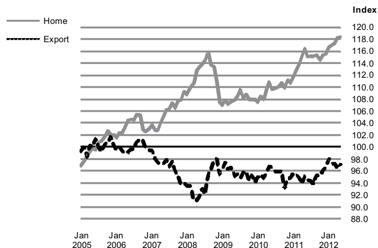
Manufacturing Industries: Output Price Indices for Home and Export Sale (Base: Year 2005 as 100)

1 Energy products excluding electricity.