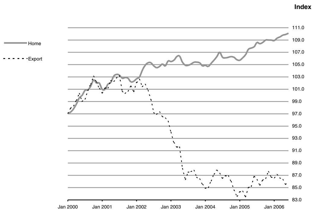
Manufacturing Industries: Output Price Indices for Home and Export Sales (Base: Year 2000 as 100)

1 Energy products excluding electricity.