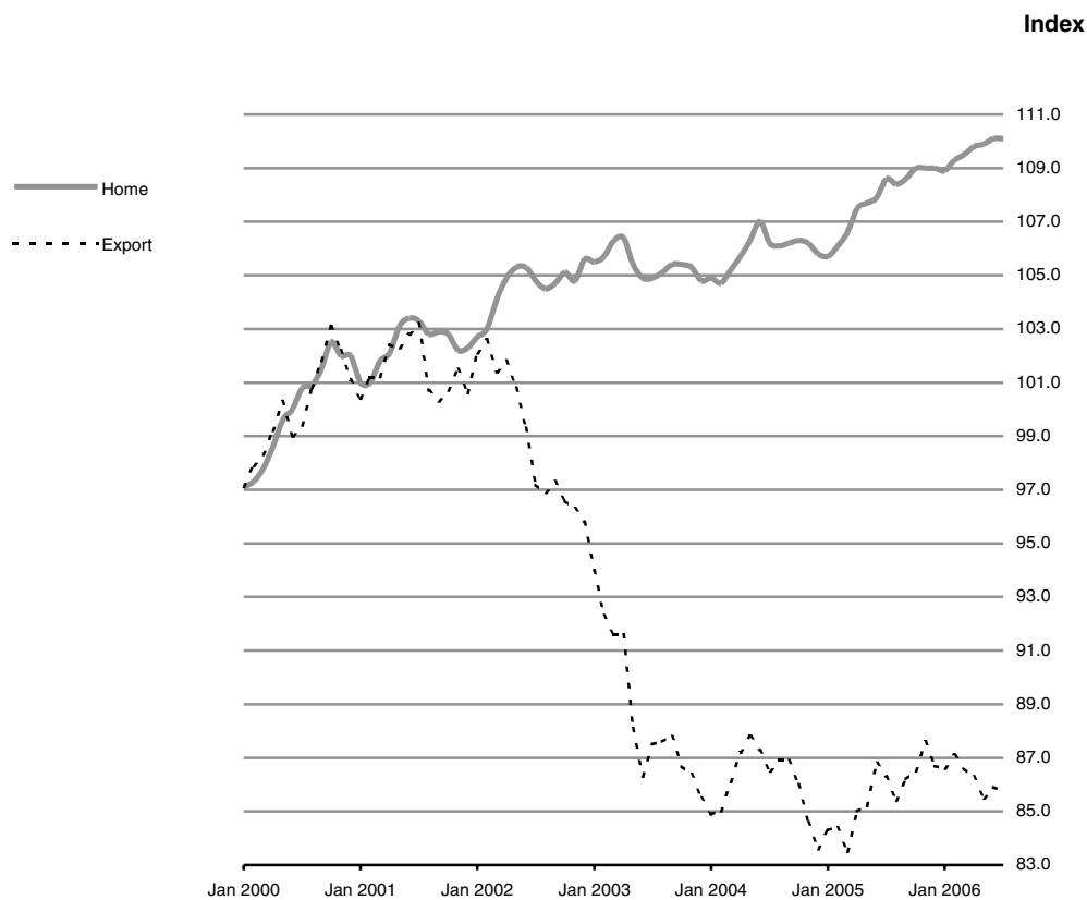
Manufacturing Industries: Output Price Indices for Home and Export Sales (Base: Year 2000 as 100)