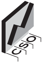
Pension coverage for persons in employment aged 20 to 69 years