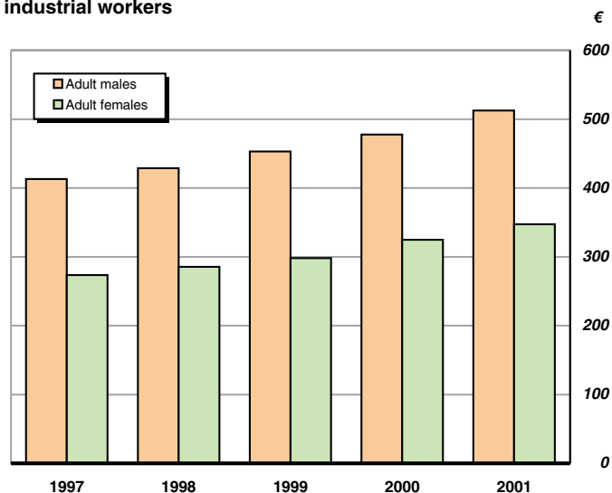
Manufacturing industries: Average weekly earnings of industrial workers